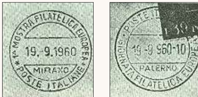
D’Urso T-47 cancel (left) and the T-48 cancel (right) Both were used only on 19 September 1960, the first day of issue.