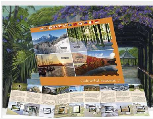
The 2016 Collection Folder

The Parish Walk is an annual event, so called because it passes through every parish on the Isle of Man, for a total of 85 miles (137 km). See EN# 434-20 for more information.