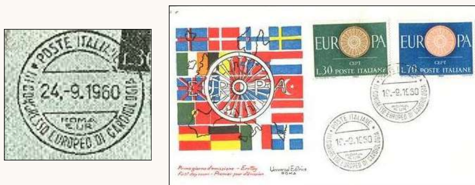
D’Urso R-14 cancel used 19-24September 1960. Thus the first day of the congress coincided with the first day of issue of Italy’s 1960 Europa set.

In addition to the “Roma” cancel on the previous page, first day cancels from four other cities/events are listed in D’Urso as well as the fact that maximum cards exist for the issue. The four first day cancels are: Roma III Congresso Europeo de Cardiologia. This cancel is listed in D’Urso as number R-14 with a rarity factor of 3; Milano, I Mostra Filatelica Europea. This cancel is listed in D’Urso as number T-47 with a rarity factor of 3; Palermo, Giornata Filatelica Europea. This cancel is listed in D’Urso as number T-48 with a rarity factor of 3. Torino, Mostra Europea Franco-bollo Sportivo. This cancel is listed in D’Urso as number T-49 with a rarity factor of 3. All four of the cancels are illustrated below or on the next page,