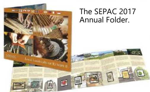
The SEPAC 2017 Annual Folder.

It was stated in EN# 441-5 that this seemed to be a strange choice for “Local Handcrafts,” but maybe memorials are Gibraltar’s forte. ■