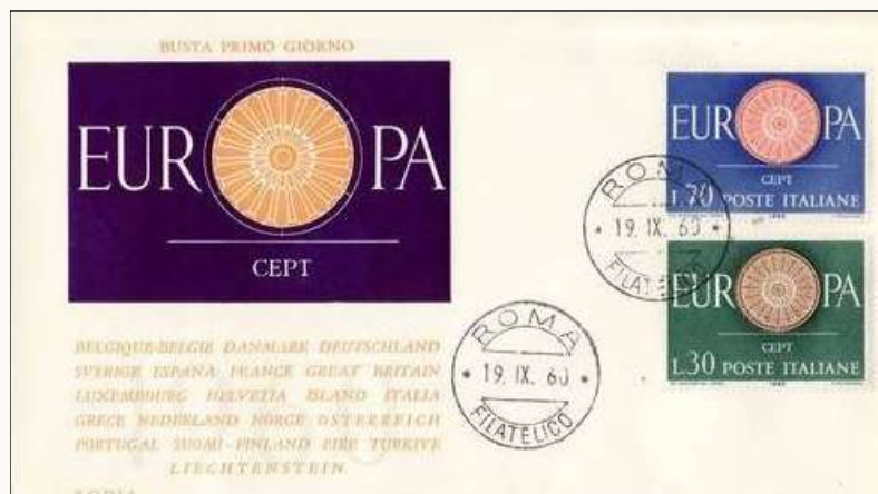
First day cover with Rome cancel.

Both stamps can be found overprinted with the word “ANNULLATO” which translates as “specimen.”