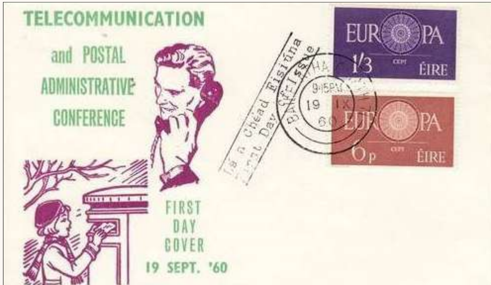
First day cover with Dublin cancel.