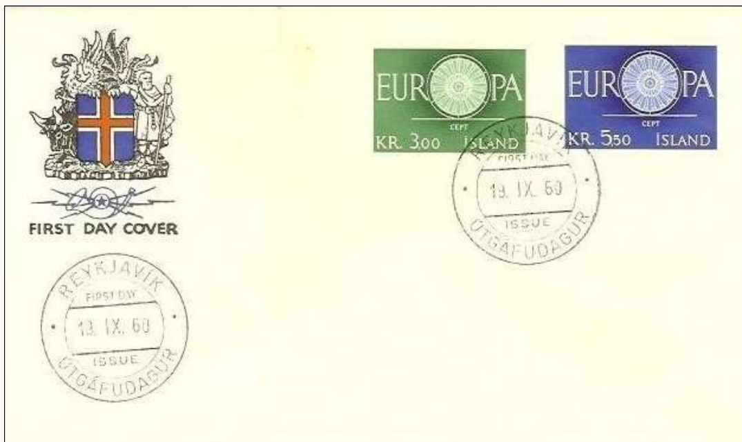
Official Reykjavik first day cancel.

D’Urso reports one variety for this issue. There is a white stroke (line) to the bottom left of the wheel. A first day cover and maximum card are reported.