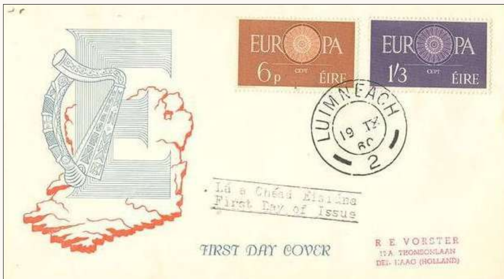
Luimneach (Limerick) first day cancel.