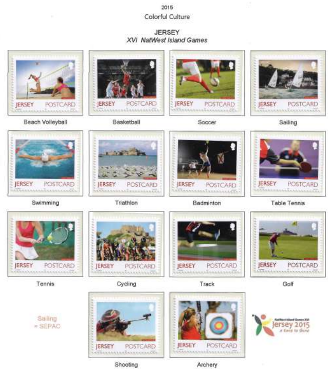
This week-long event saw ~ 3,000 competitors from 24 islands take part in the 14 sports shown on the stamps. The official mascot of the games was a real-life infant silverback gorilla named Indigo who lives at Durrell Wildlife Park in Trinity, Jersey.